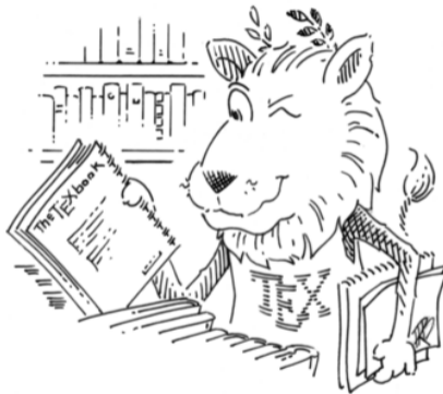
Figure 1: Example of a figure.