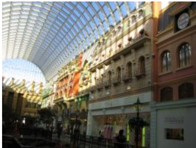
Figure 3.1: Caption.