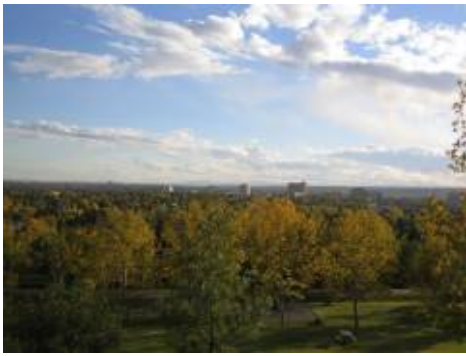
(a) Subcaption 1